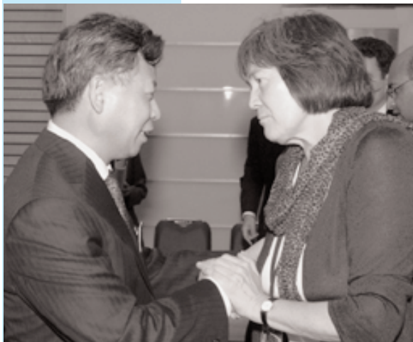
JIN Lian (left), China's Vice-Minister of Finance, confers with Clare Short, U.K. Secretary of State for International Development.

At our meeting last April, we welcomed the very important progress achieved in Monterrey, laying out a new partnership between developed and developing countries, based on mutual responsibility and accountability, to achieve measurable improvements in sustainable growth and poverty reduction. We welcomed the announcements by a number of donors of significant increases in their official development assistance.