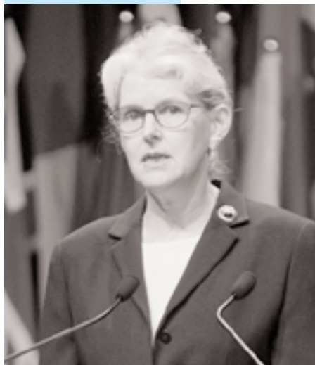
Bodil Nyboe Andersen, Danish Central Bank Governor, addresses the plenary session.

The IMFC also welcomed the IMF's recent adoption of new guidelines on conditionality, the outcome of a review initiated by Köhler two years ago. "The consistent implementation of these guidelines will help enhance the effectiveness of IMF-supported programs by fostering national ownership and streamlining conditionality, focusing it on elements critical to the success of members' economic programs," the communiqué said. ■