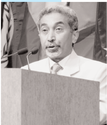
Prime Minister Mari Bin Amude Alkatiri of the Democratic Republic of East Timor—the newest member of the IMF.