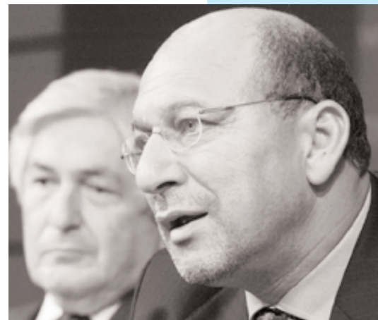
Trevor Manuel, Development Committee Chairman and South African Finance Minister, speaks at a press conference as World Bank President James Wolfensohn looks on.

We welcomed the continued progress made on the Heavily Indebted Poor Countries (HIPC) Initiative and reconfirmed our commitment to its implementation and full financing. We fully support the objective of helping our poorest, most heavily indebted members achieve an enduring exit from unsustainable debt, but we recognize that considerable challenges remain. Success will require a sustained commitment by HIPCs to improve domestic policies and economic management; capacity building for the management of financial assets and liabilities; full participation and delivery of relief by all affected creditors; and adequate and sufficiently concessional financing by international financial institutions and the donor community. We call upon all official and commercial creditors that have not yet done so to fully participate in the HIPC Initiative. We have asked the Bank and the IMF to undertake an early review of the difficult issues of HIPC-to-HIPC debt relief and creditor litigation. We stressed