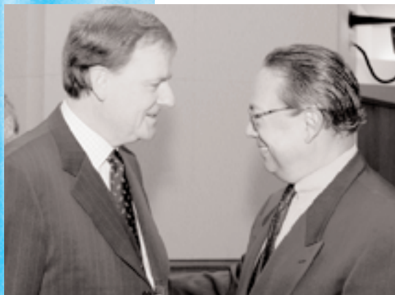
Australia's Treasurer Peter Costello (left) speaks with Brazilian Finance Minister Pedro Malan before the IMFC meeting.

Many of the developing countries have also been affected by global developments and adverse movements in commodity prices, as well as domestic circumstances. The Committee reiterates the need for sustained international efforts to fight poverty. The Global Development Compact embodied in the Monterrey Consensus and the Doha Development Agenda—based on mutual accountability, country ownership, sound domestic policies and institutions, good governance, increased and more effective international support, and commitment to an open multilateral trading system—was reaffirmed at the world summit in Johannesburg. The Committee looks forward to the effective implementation, with international assistance, of the New Partnership for Africa's Development to strengthen institutional foundations, governance, and infrastructure. Stressing the critical importance of technical assistance to support this effort, the Committee looks forward to the important contribution that the