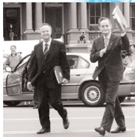
German Finance Minister Hans Eichel (left) and French Finance Minister Francis Mer enter the Group of Seven meeting.