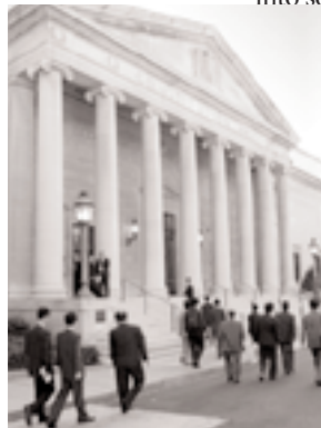
DAR Constitution Hall.

Under the plan, a country with an unsustainable debt burden would be able to enter into something akin