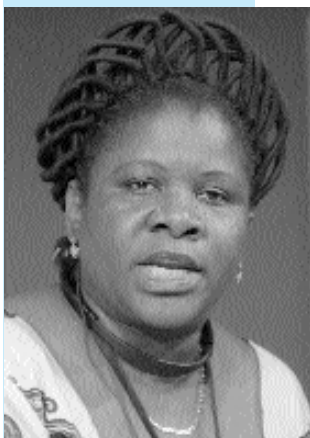
Luisa Dias Diogo