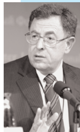
Fuad Siniora, Finance Minister of Lebanon.