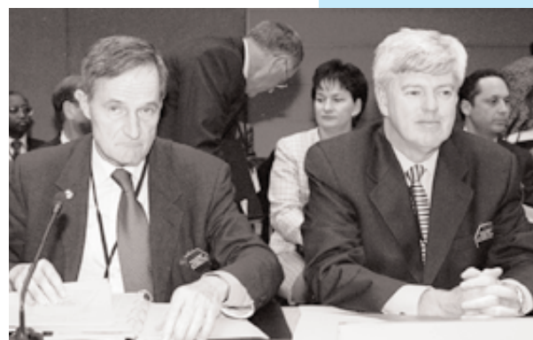
Awaiting the beginning of the Developing Committee session are Francis Mer (left), France's Minister of Economy, Finance, and Industry, and Canada's Finance Minister John Manley.