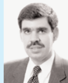
El-Erian: The debate on the SDRM has triggered an intense discussion between the private and public sectors.