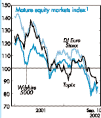
1 September 10–14, 2001 = 100; national currency. Data: IMF, World Economic Outlook , September 2002