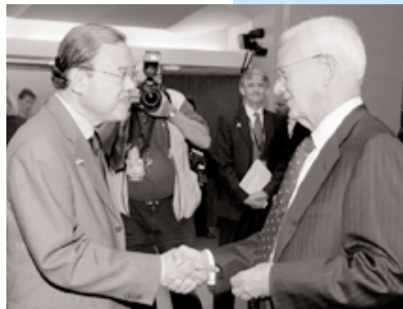
Panitchpakdi Supachai, Director-General of the World Trade Organization, left, greets U.S. Treasury Secretary Paul O'Neill.

The Committee strongly welcomes the progress made with the contractual and statutory approaches to restructuring unsustainable sovereign debts. It welcomes the ongoing dialogue on collective action clauses