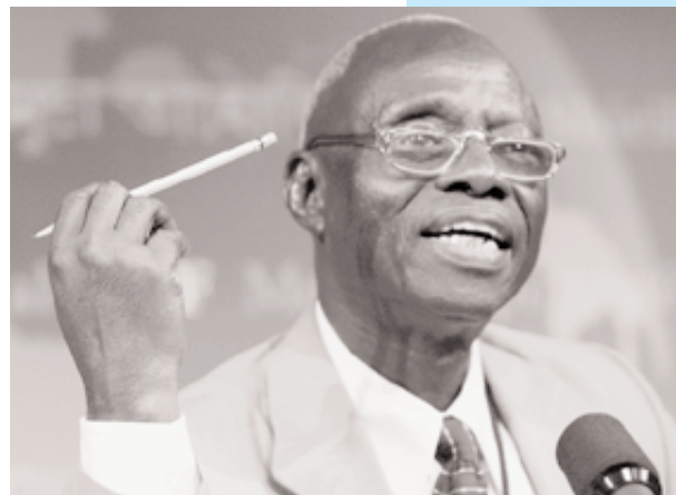
Mallam Adamu Ciroma, Chair of the Group of 24, makes a point at a press conference.

Ministers reiterate their grave concern at the loss of lives and the catastrophic situation in the Palestinian territories. They greatly regret the recent deterioration in the situation and the continued destruction of capital and infrastructure provided to the Palestinian people and Authority by the international community, including the World Bank. They note the great human and economic ramifications of this grave situation for the