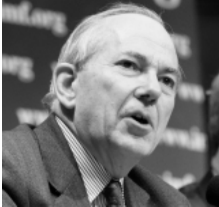
Camdessus: Seattle tells us something about the need to clarify where the responsibilities lie for the economic governance of the world.

Now, yes, there is resurgence, with stability, and all the prospects for higher-quality growth in Korea. But vigilance is always in order. Korea can forget about the IMF, but Korea should not forget the policies it adopted