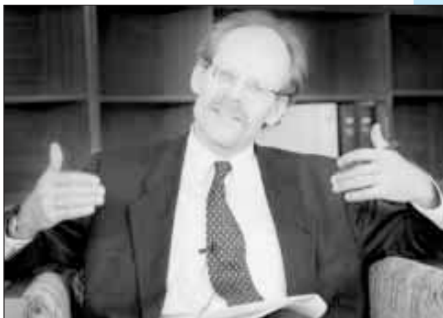
Ingves: It is very hard to develop standards in isolation. You need a process that lets people talk to each other about what seems reasonable.

tionship evolving over time and will there be problems developing out of the different responsibility for monetary and fiscal policy?