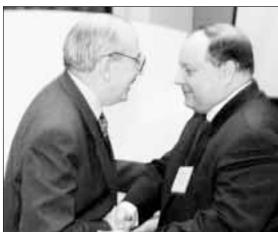
At the opening session, IMF Managing Director Michel Camdessus (left) greets Egor Gaidar, former Prime Minister of Russia.

and time-consuming task of creating a modern, effective state and building institutions supportive of a market-oriented economy. (Please turn to the following page)