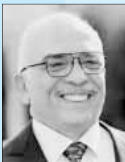
H.M. King Hussein of Jordan

IMF Managing Director Michel Camdessus expressed his formal condolences on the death of the King of Jordan. Following is the text of news brief 99/6, issued on February 7.