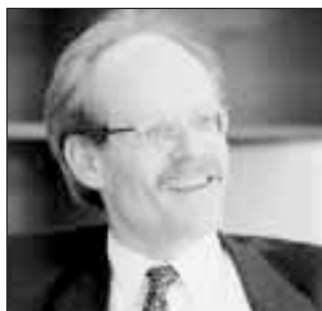
Stefan Ingves, IMF's Monetary and Exchange Affairs Department Director.

INGVES: Virtually all of my professional career has been in the financial sector, not only as a central banker but in many other areas as well. So I have a reasonably good idea about what a financial sector looks like in a country, or perhaps, what it should look like—particularly if you are looking at a heavily regulated system that needs to change. The financial sector (Continued on page 54)