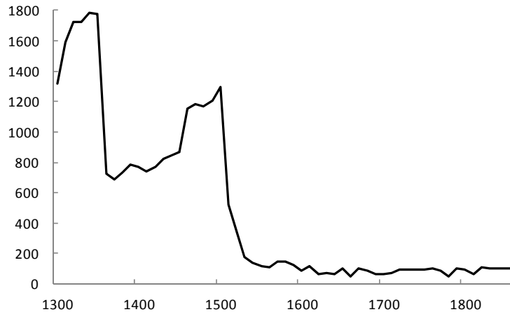
Figure 1. England. Index of the Real Price of Books, 1300–1860 (1860 = 100)

The openness of medieval kingdoms and city-states should not be exaggerated. Rulers’ desire to keep things secret (evidenced by their employment of “secretaries”), the power of the elite, the limits of technology, and low rates of literacy meant that the number of people who could get hold of and understand fiscal information was no doubt small. 37 As time passed, improvements in technology and the gradual spread of literacy reduced these obstacles to effective transparency. In particular, the diffusion of knowledge about paper-making (from around 1150) and then printing (from around 1450) 38 dramatically reduced the price of books. (See Figure 1 for an estimate of the decline in England). But fiscal transparency did not increase in the way that improvements in technology would have allowed. City-states were taken over by unaccountable strongmen, parliaments lost power, and if anything fiscal transparency declined. 39