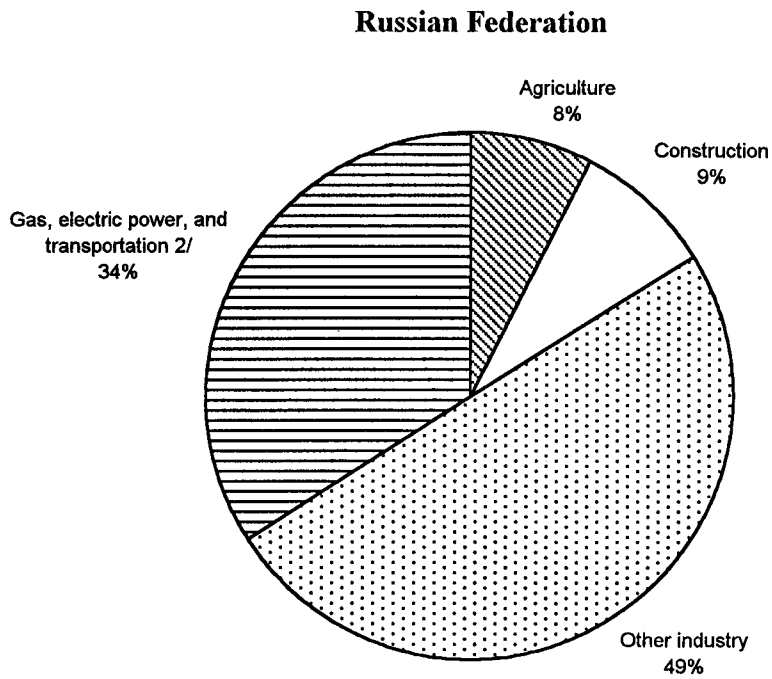
Chart 2 Sectoral Composition of Overdue Debt, January 1, 1997 1/