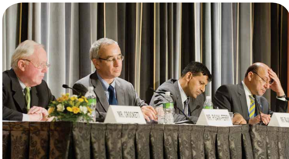
The Per Jacobsson Foundation panel, comprising (from left) Andrew Crockett, Jean Pisani-Ferry, Raghuram Rajan, and Trevor Manuel, discussed how the IMF should be reformed to take on a new role.

He asked the panel to consider four questions: