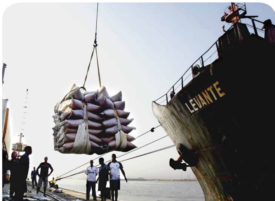
Global economic activity is slowing quickly amid deepening financial stress, the IMF says in its latest world forecast.

• Activity in the advanced economies is now expected to contract by \frac{1}{4} percent on an annual basis in 2009, down \frac{3}{4} percentage points from the October 2008 WEO projections. This would be the first annual contraction during the postwar period, although the downturn is broadly comparable in magnitude to those that occurred in 1975 and 1982. A recovery is projected to begin late in 2009. The U.S. economy will suffer, as households respond to depreciating real and financial assets and tightening financial conditions. Growth in the euro area will be hard hit by tightening financial conditions and falling confidence. In Japan, the support to growth from net exports is expected to decline.