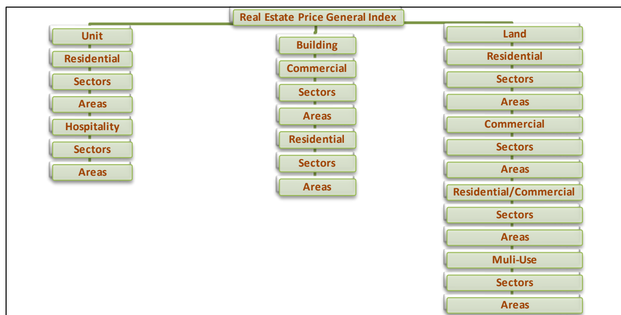
Figure 2. Current Structure of the REPI

12. An overall real estate price index, the REPI, is compiled covering all property types. The current structure is as follows: