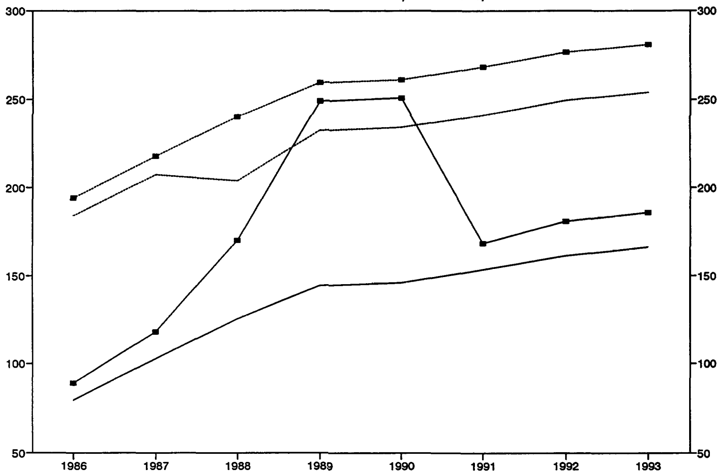
Figure 1. Nigeria and Neighboring Countries Petroleum Price Differentials, 1986-93 1/